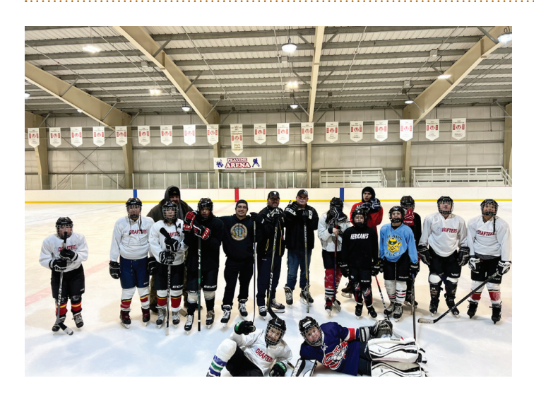
The hockey sessions are held every Tuesday and Thursday divided into two groups with both working on skill development. High school students work on leadership skills during the sessions as helpers.