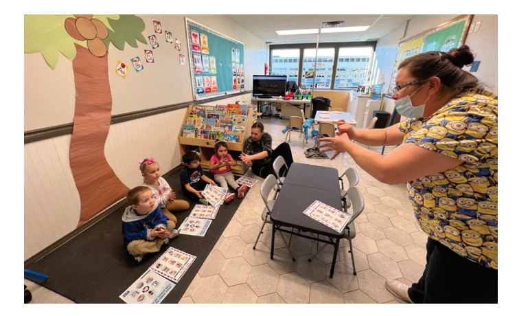
Pre school K4 enjoys participating in hygiene / hand washing teaching from the Kapawe'no Health Centre. Amazing collaboration and work.