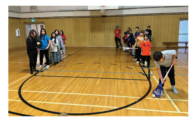
The introduction into the great sport of Lacrosse being taught at the younger grades.