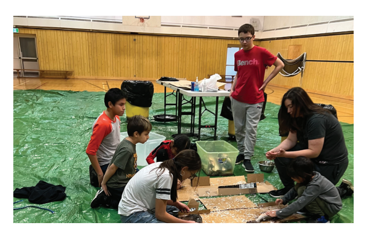
Early grade students enjoy dressing the fish caught in the bay that day. The water base training is great for all students.