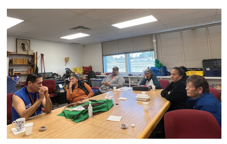
Kapawe'no Knowledge Council continue to meet with Eduction reviewing the strategic plan and next steps.