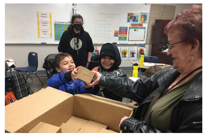
Grouard Seniors hand out earphones donated by them to support our students to achieve high academics and studies.