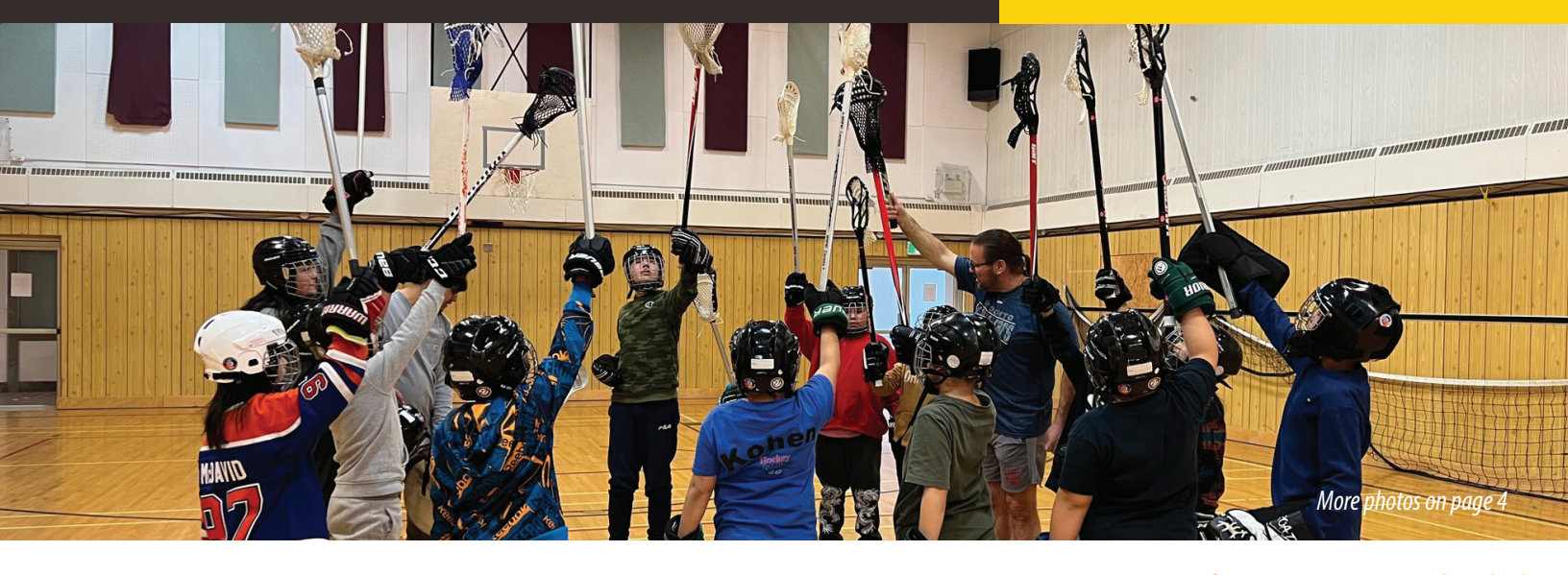
Kapaweno First Nation School