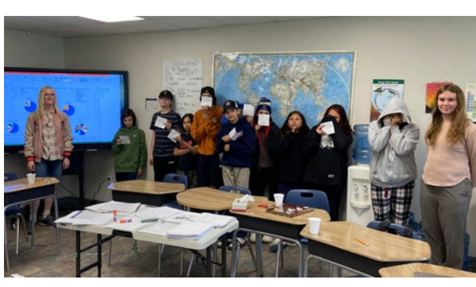
Keep up the great work 6/7 class.

The kids had fun writing down their answers, folding their papers and then finding out the results.